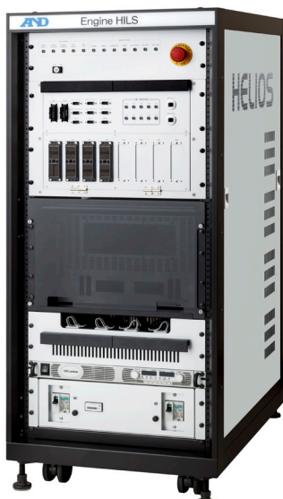
Standard HILS rack 24U